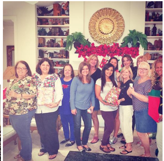
Above 2: Stocking Stuffer Event is a wonderful time to reflect on the end of the year and make some new friends.